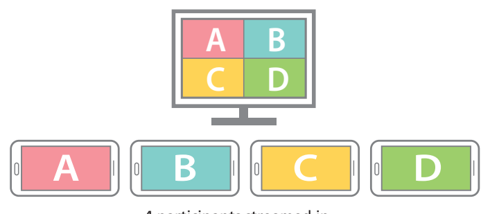
4 participants streamed in

Expedite collaboration with bi-directional content streaming of up to 4 participants simultaneously. Click the "Start Sharing" button to stream in presentation contents from the laptop or mobile device, as well as "Go Live" to stream out presentation contents in real-time to participants located in different parts of the vicinity. Streamed contents can be displayed across all participants' devices as well.