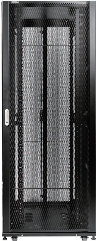
Server Rack 42U 1000D×600W (mm)